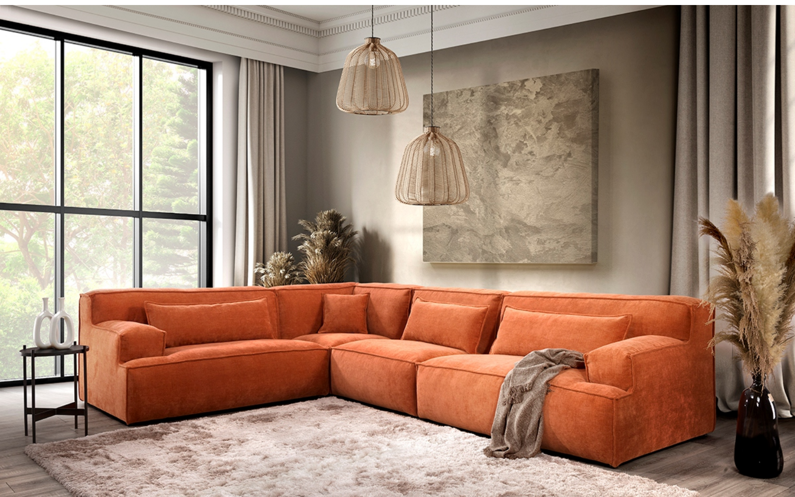
Lecco 1,5 MAX PL – C – 1,5 AL. – 1,5 MAX PR Fabric: Terranova 16