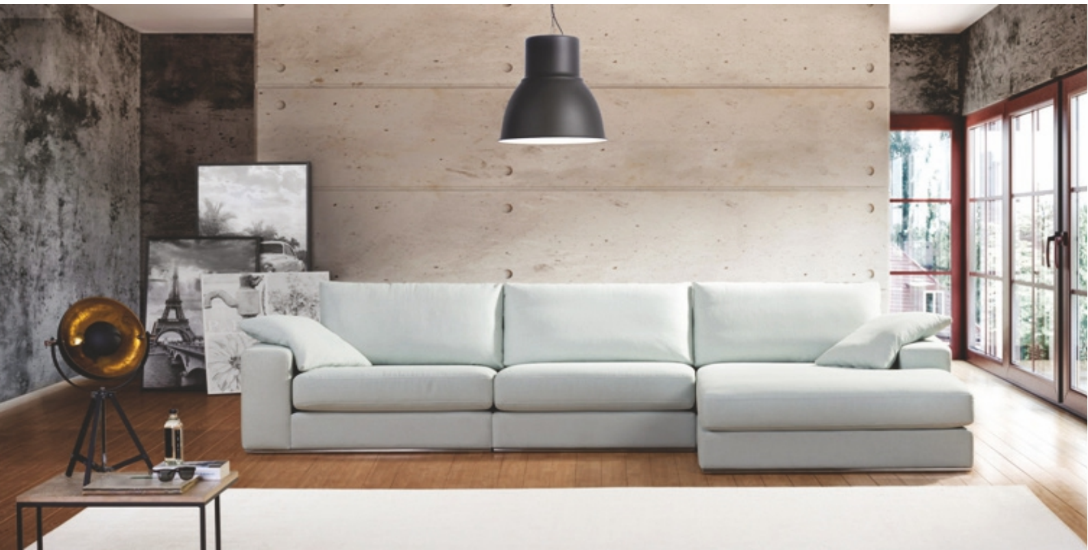
Alberta 1 MAX PL-1 MAX AL-D MAX R