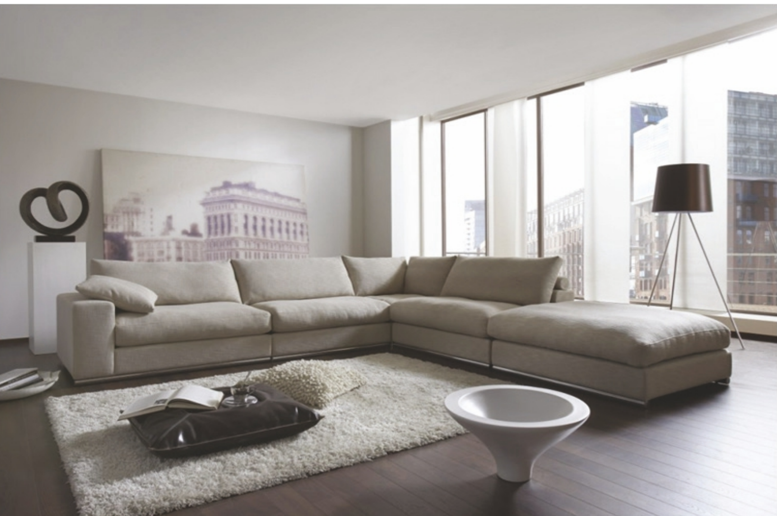
Alberta corner group 1,5 PL-1,5 AL-C-1,5 AL-stool