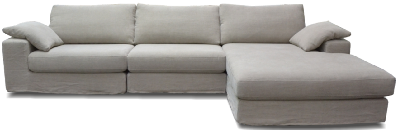
Alberta 1 MAX PL-1 MAX AL-D MAX R L.C.