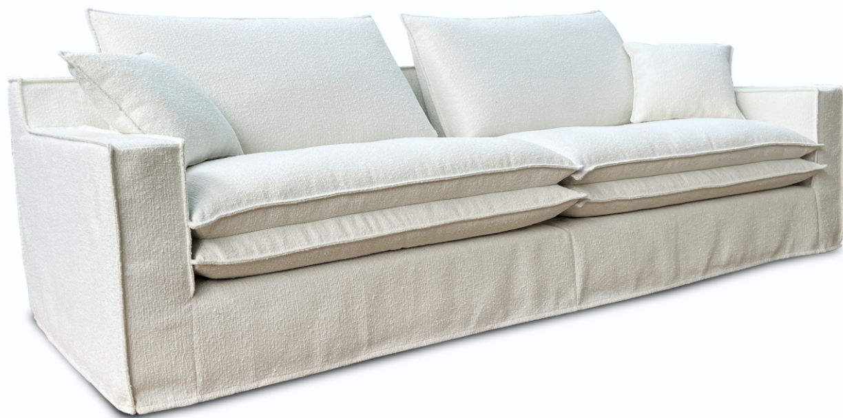
Amelia 4 Sofa(split)